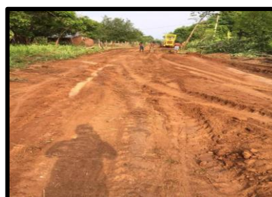
Welioya Integrated Development Project -System L