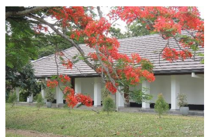
Kothmale Maduruoya Ruhunuketha